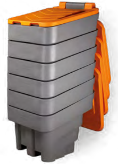
STACKED GRIT BINS