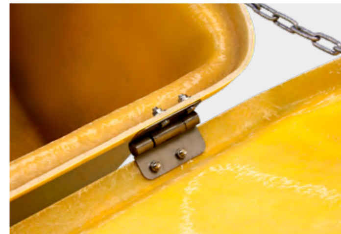
stainless steel hinge detail