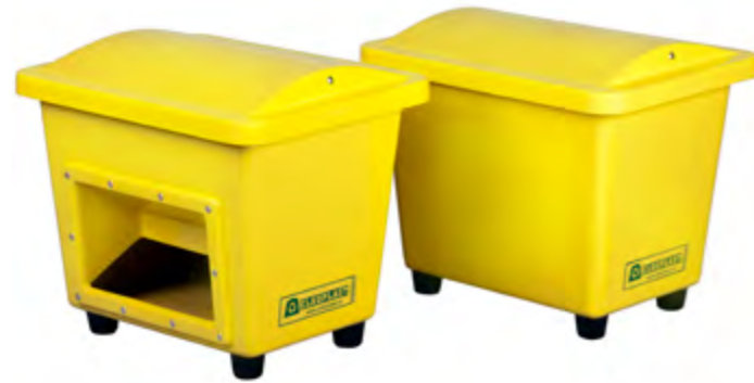
SBA 110 with/without emptying opening.