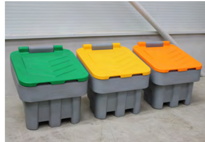
ARROW 400 different lid colours